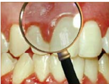
Inflamed and swollen gums.

When too much bone is lost, there's so little support for the teeth, they get loose and have to be removed.