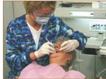
More frequent dental exams