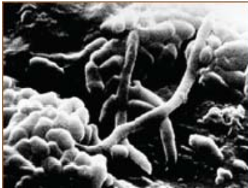
Microscopic view of plaque

Periodontal disease is an infection of the teeth, gums, and bone that surrounds your teeth. It's caused by the bacteria that live in plaque, the sticky film of food and bacteria that forms constantly on your teeth. The bacteria infect the tooth roots and cause pockets of infection to form in the gums. This results in red and swollen gums that bleed when you brush or floss.